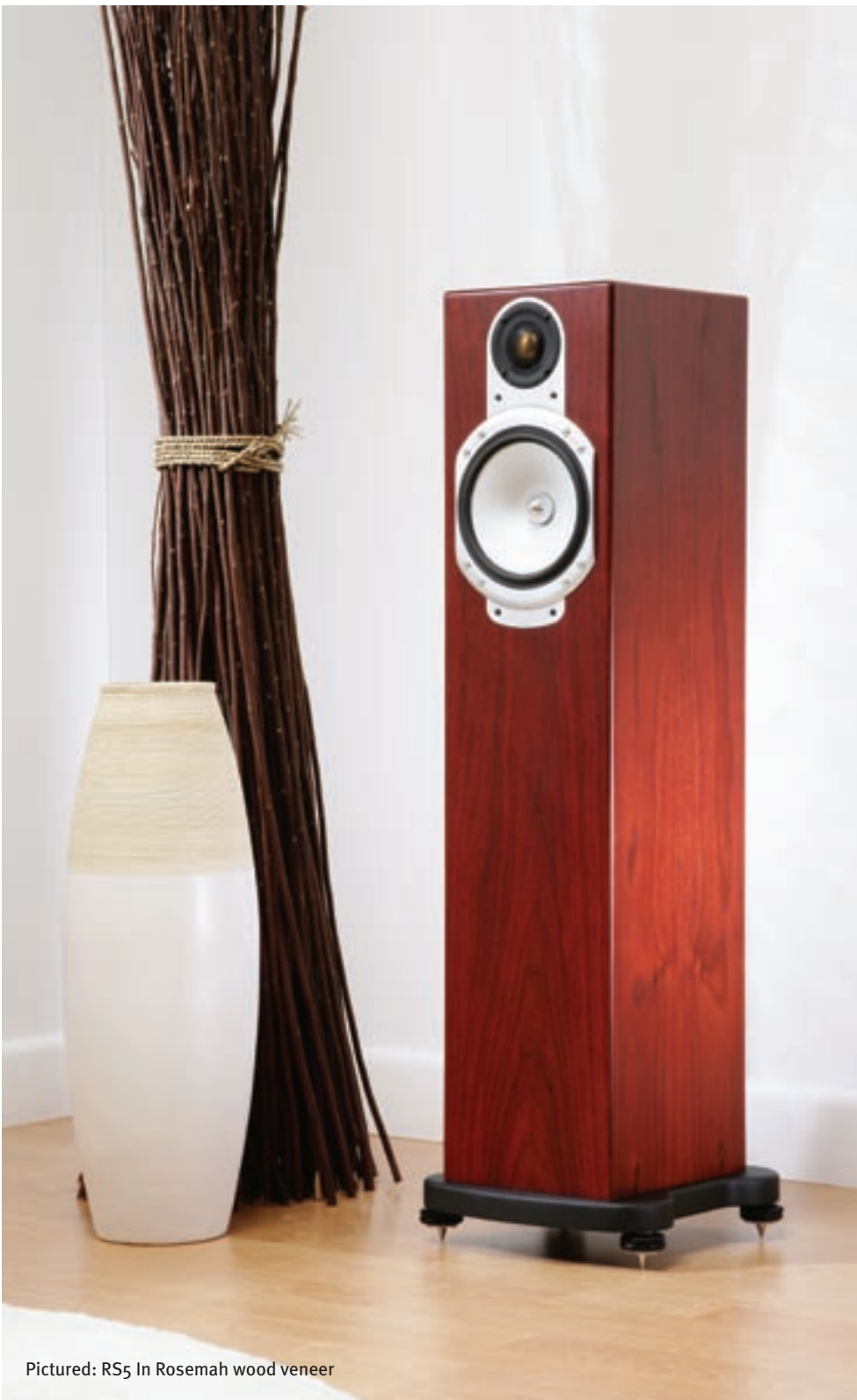
Pictured: RS5 In Rosemah wood veneer