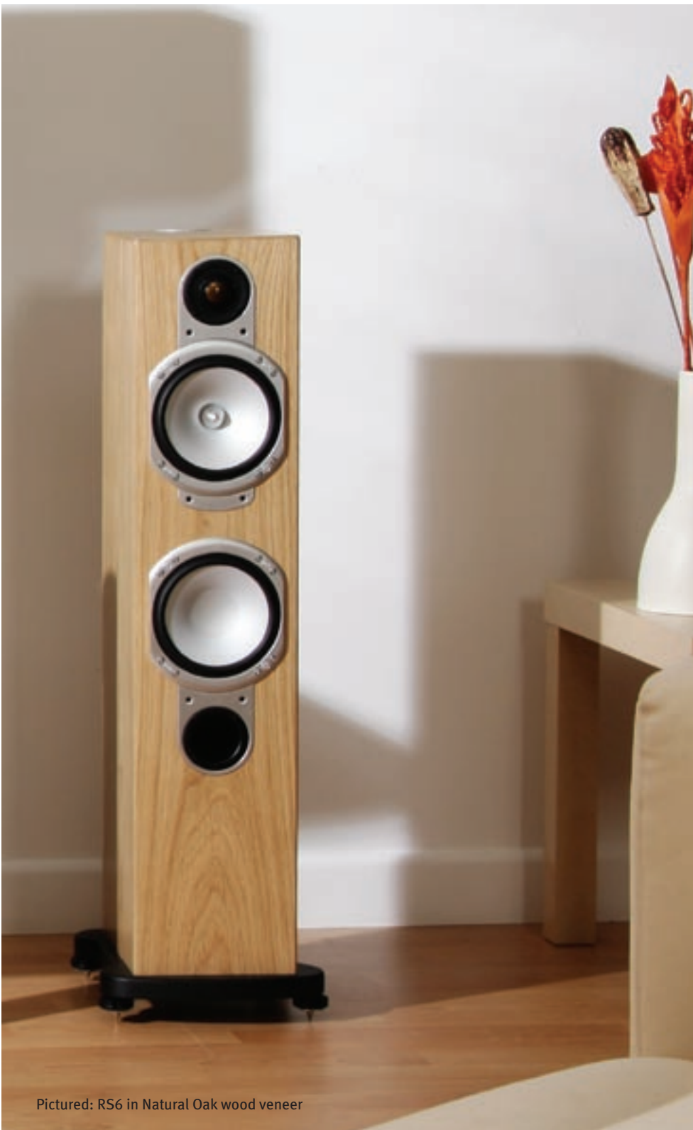
Pictured: RS6 in Natural Oak wood veneer