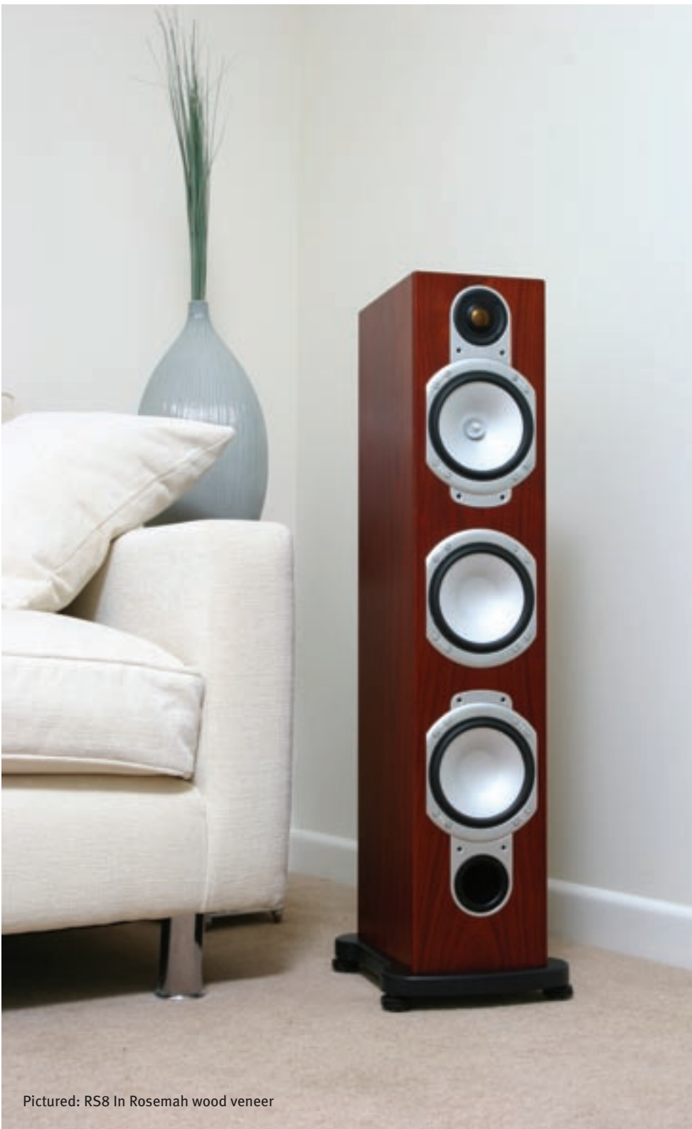
Pictured: RS8 In Rosemah wood veneer