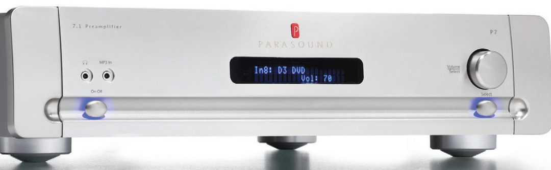
Available from Fall 2007