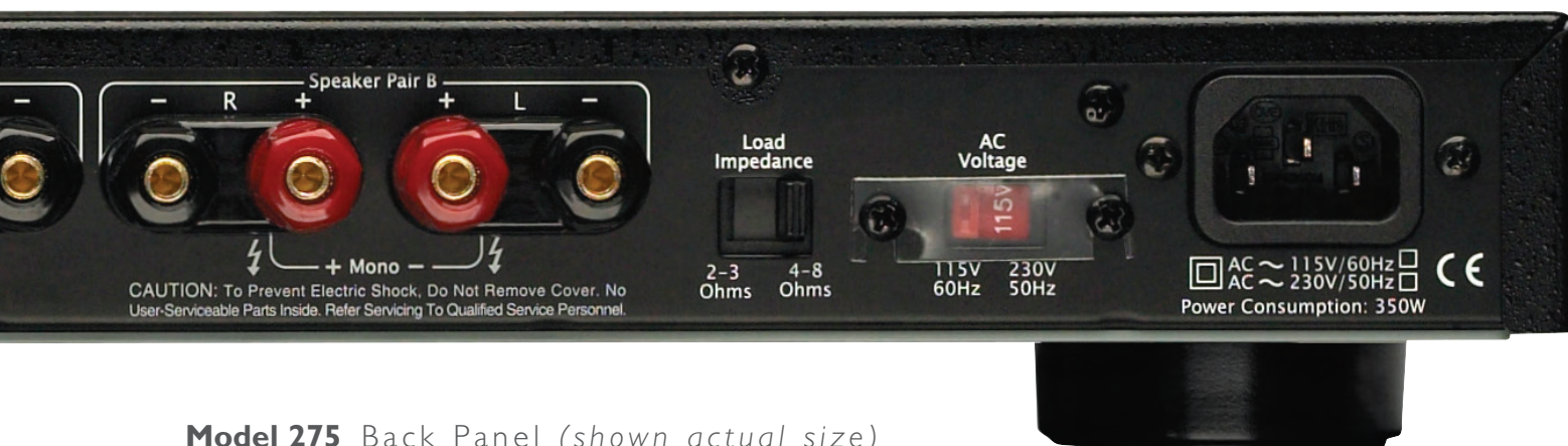
Model 275 Back Panel (shown actual size)

For more Model 275 information & its owner's manual, please visit www.parasound.com .